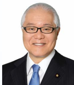
Keizo Takemi (Japan's Diet)