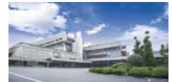
Congress Venue Kyoto International Conference Center Takaragaike, Sakyo-ku, Kyoto 606-0001, JAPAN

Kansai International Airport (KIX) The main international access point to Kyoto. The airport connects with over 70 cities, and major international carriers operate daily flights to multiple destinations. Also, KIX has a terminal that was specifically built for low-cost airlines; this has significantly improved access from greater Asia.