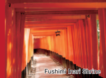
Fushimi Inari Shrine